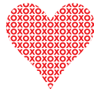
MIAMI ROMANCE MONTH jun