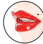
MIAMI SPICE RESTAURANT MONTH aug+sep