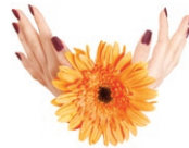
MIAMI SPA MONTH jul+aug