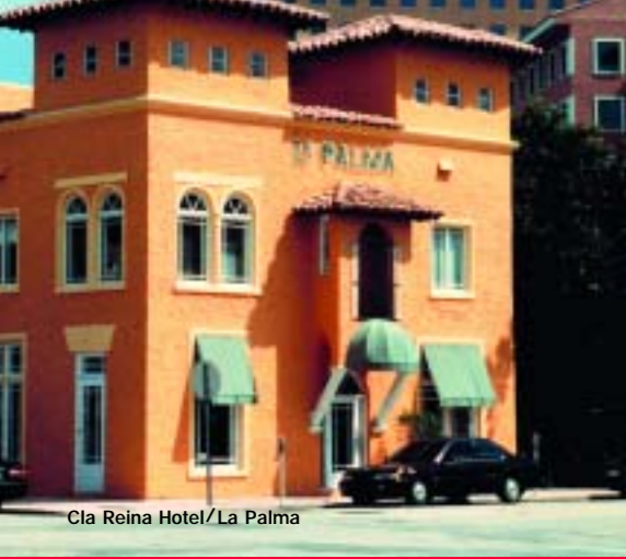
Cla Reina Hotel/La Palma