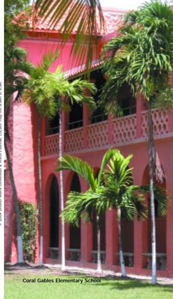
Coral Gables Elementary School

Locators map not drawn to scale.