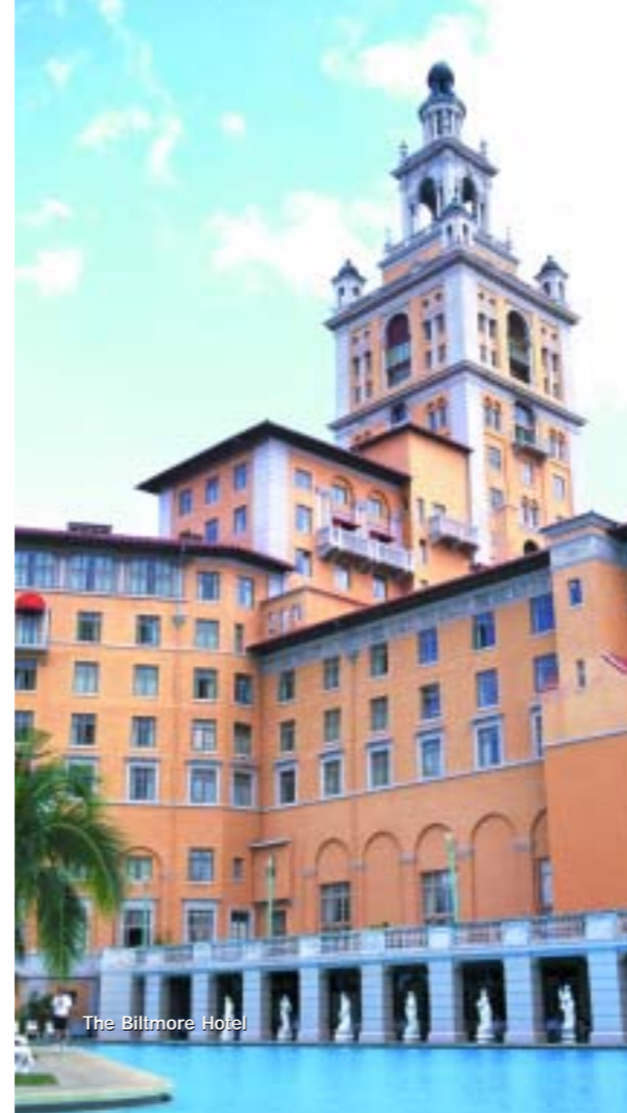
The Biltmore Hotel