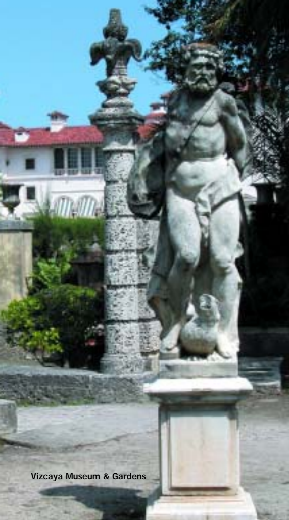
Vizcaya Museum & Gardens