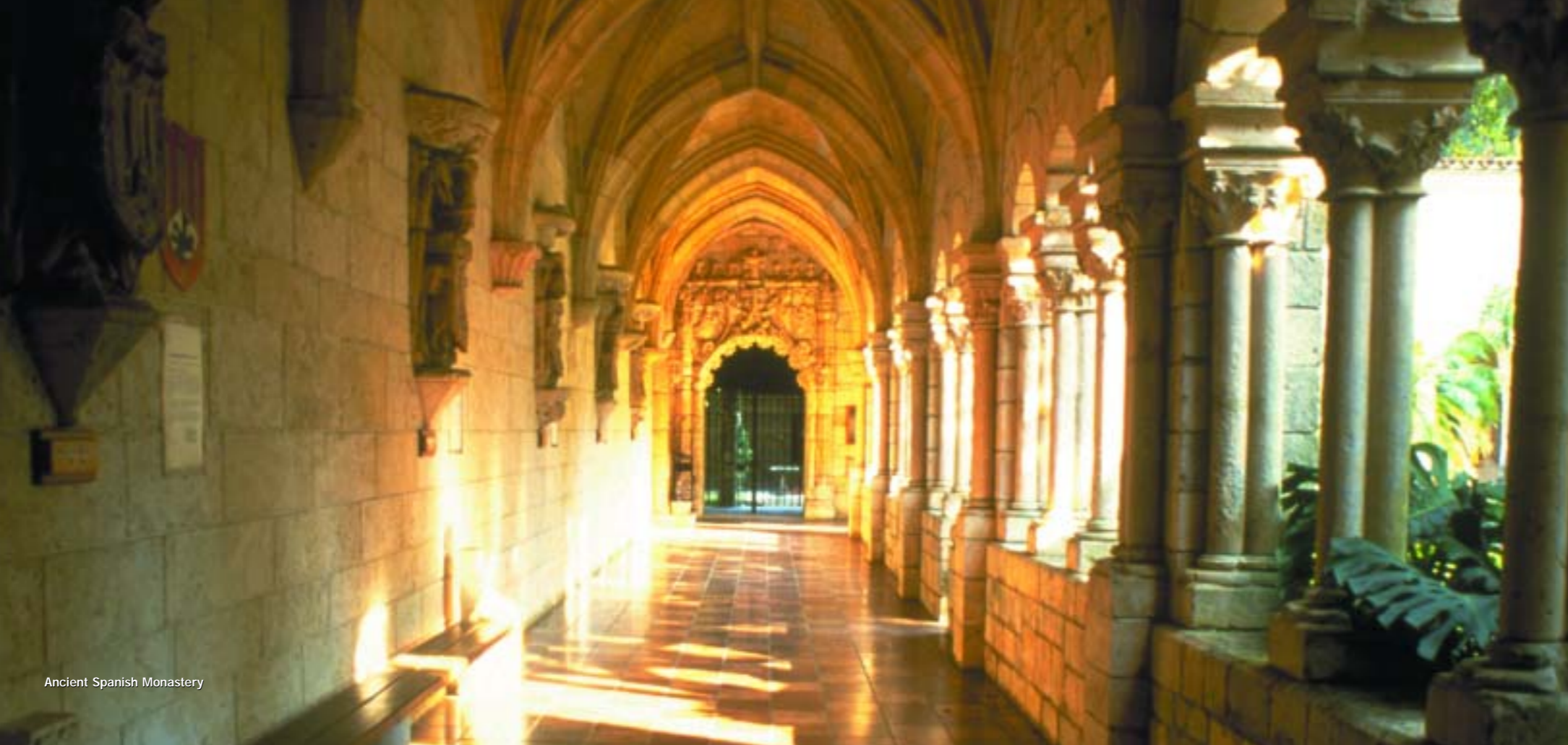
Ancient Spanish Monastery