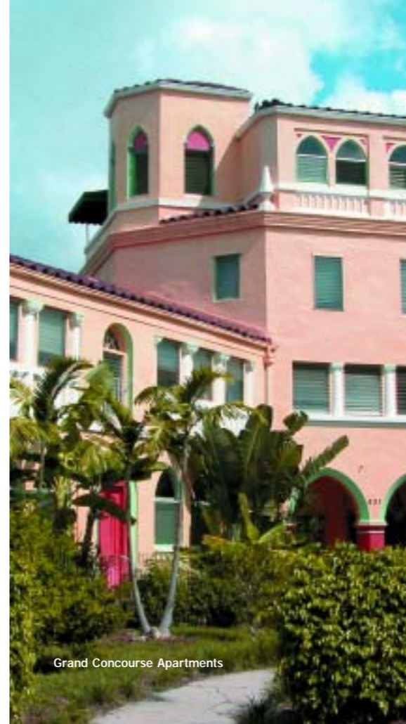
Grand Concourse Apartments