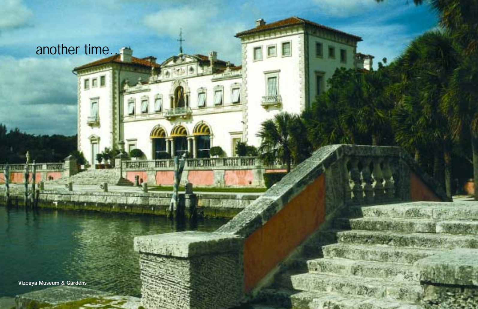
Vizcaya Museum & Gardens