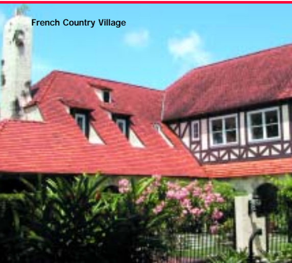
French Country Village